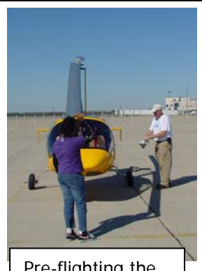
Pre-flighting the gyroplane