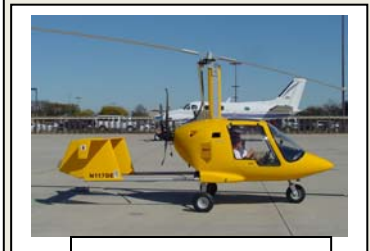
Preparing to taxi